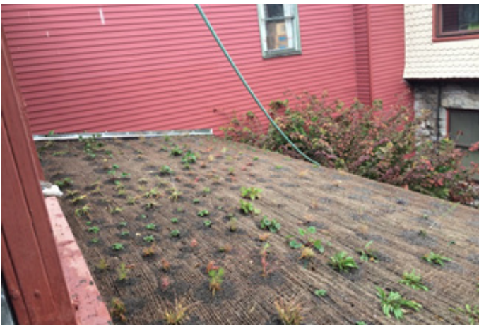
A green roof at ASLF headquarters.

management demonstration projects in the “036 Combined Sewer Overflow (CSO) basin” of the Near Westside neighborhood in Syracuse, NY. This is the largest and most trafficked CSO drainage basin in the Near Westside, and green infrastructure within it will contribute to the largest CSO reductions in the neighborhood while also providing the most visible examples of GI to the community. The suggestion was to make this area an education and demonstration zone for green infrastructure technologies.