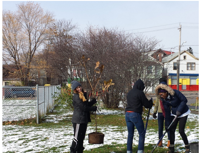
Planting trees at Pompeii North Apartments.