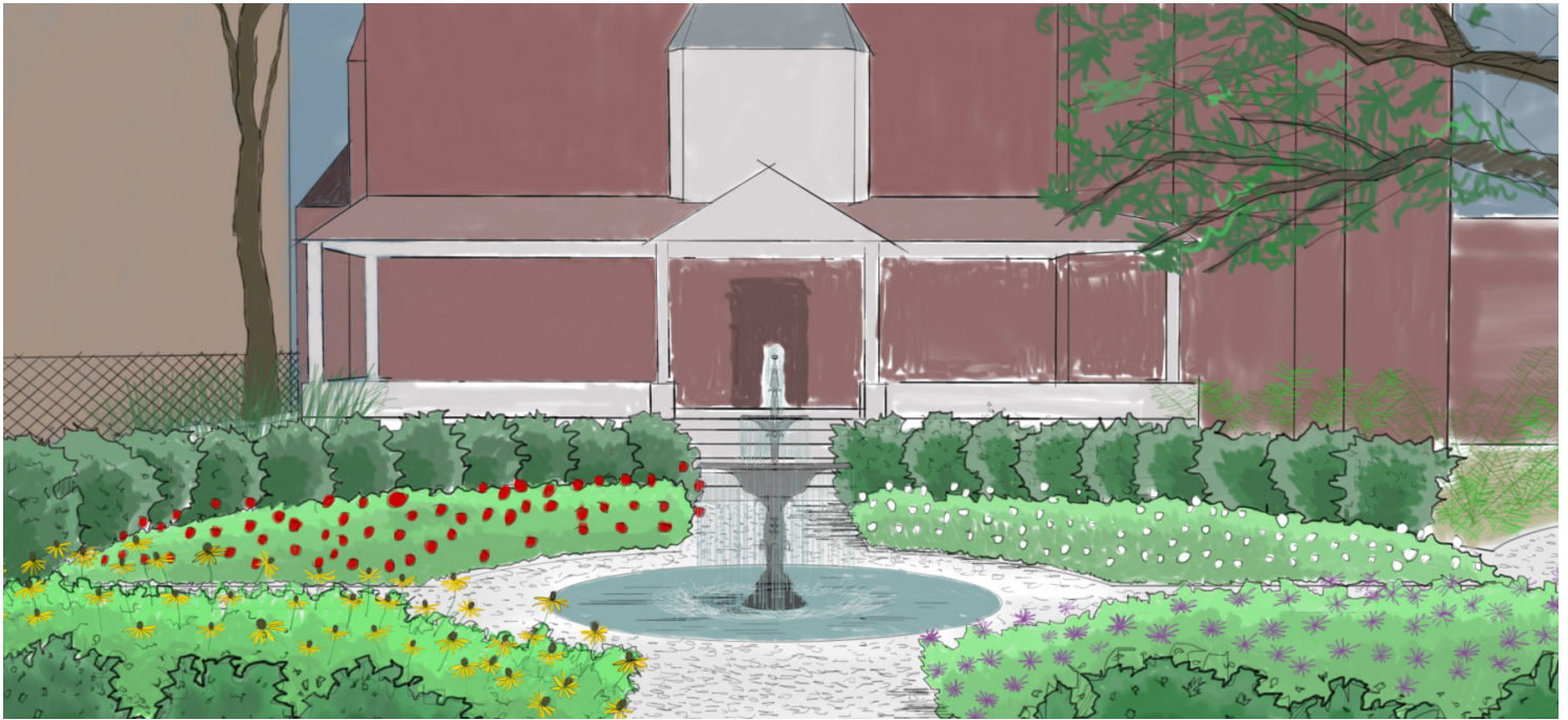
A rendering of the planned ASLF historic native plant garden.

rounded by many family homes and Sterling Creek. The mine threatens the way of life in the quiet community along with residents' safety, well water supplies, and the environment in and around Sterling Creek. The owner proposes to process material from the mine on site and fill up to 10 trailer trucks per hour. He plans to remove, process, and haul away up to 60 feet of material over about a 35 acre area next to Sterling Creek, potentially more than 50,000 cubic yards over the life of the mine.