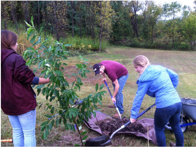
Planting trees in Oakwood Cemetery.