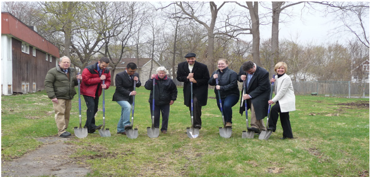
Groundbreaking ceremony for the ASLF urban tree nursery, April 2015.