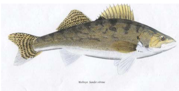
Walleye

In April of this year, Atlantic States Legal Foundation launched a new initiative to create awareness in the non-English speaking immigrant community about consuming Onondaga Lake fish that are contaminated with mercury, PCBs, and other toxins. Funding is provided by US EPA Region 2 and the Onondaga Lake Partnership.