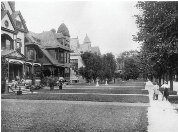
West Onondaga Street Historical Photo

ASLF staff is currently developing a plan for performing this outreach in the affected communities near the existing and future projects. Partnering with other City, County, and STR consultants will allow us to achieve our desired outcome.