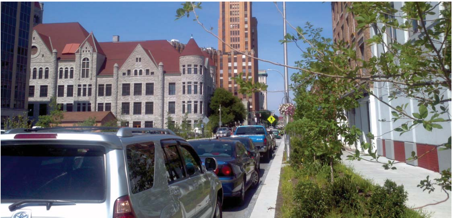
Save the Rain Green Corridor Project - 300 Block of E. Water Street