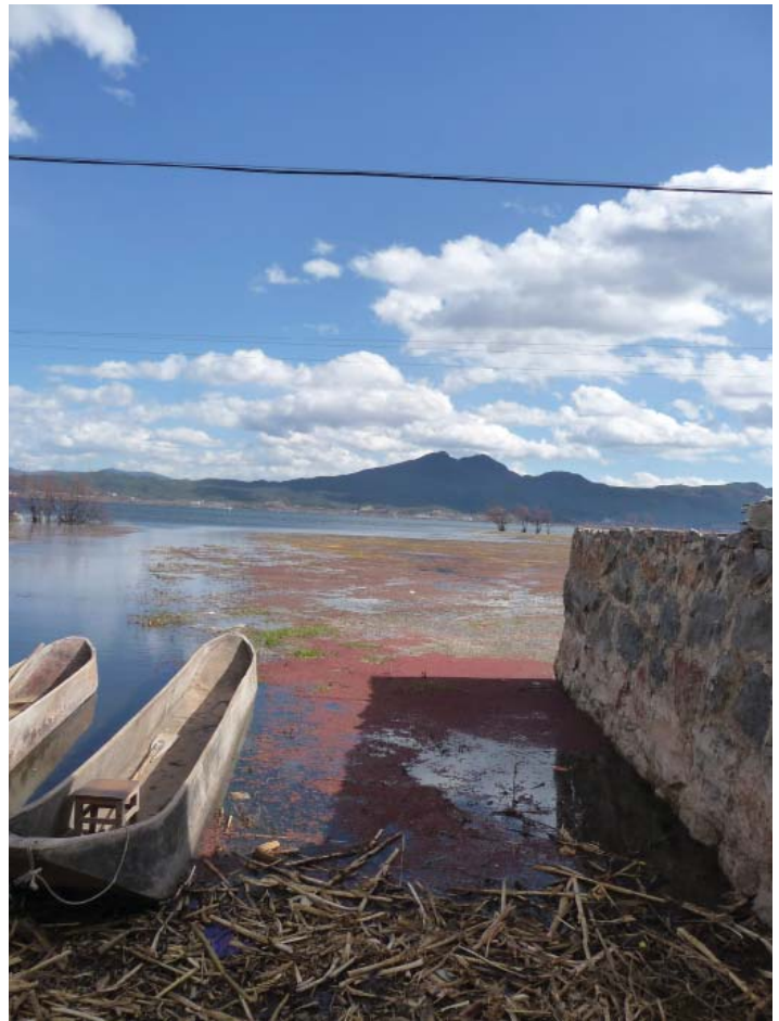
Lashi Lake, Yunnan China

G reen Watershed (based in Kuming, Yunnan Province, China) and ASLF are working together on a joint project aimed at applying each other's