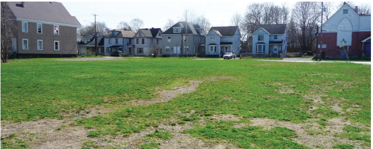
Vacant Property in the City of Syracuse

We expect to share the Exhibit with other public venues in our area to help provide information to local residents about the importance of stormwater management and hopefully inspire local students to seek careers in the sciences. If you are interested to have the exhibit placed in your location, please contact us.