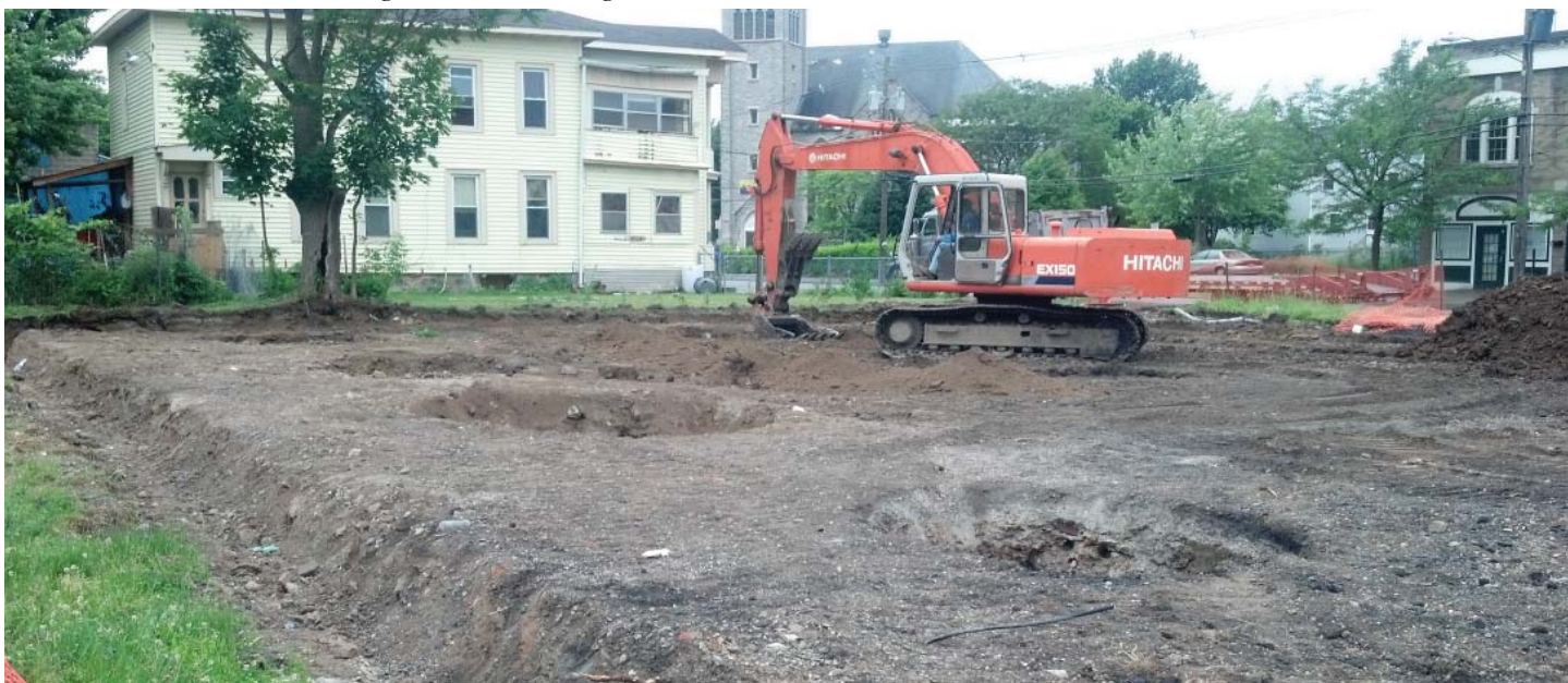
Save the Rain Vacant Lot Program - 701 Oswego Street under Construction

The City Bureau of Planning and Sustainability has been working closely with ASLF to both plan improvements for the VLP parcels and revise the City’s wise management of scarce resources in the future. The City currently is finalizing its draft of the 2040 Comprehensive Development Plan which will include many programs involving deconstruction, open space management, and others that apply directly to the VLP, while also conserving resources for future generations. Projects expected to be constructed in the coming months this year include W. Onondaga and Arthur St., 109 Hartson St., and 224-226 Putnam Street. These three projects all include tree planting and rain gardens. Being the first projects constructed, these sites were chosen for having a lesser amount of complexity than the